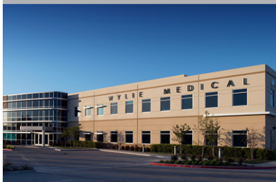
Wylie Medical Plaza 49,151 s.f. Wylie, TX