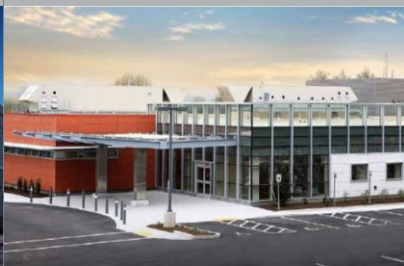
The Surgery Center 41,643 s.f. Shrewsbury, MA