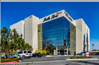
Bella Terra Medical Plaza 55,693 s.f. Huntington Beach, CA