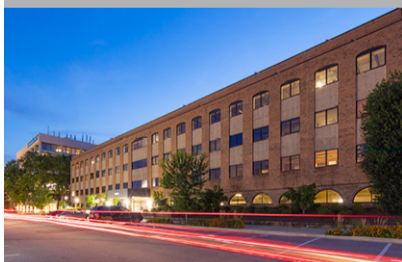
Colesville Medical Campus 212,153 s.f. Silver Springs, MD

Closed - Investment Advisory & Debt Placement