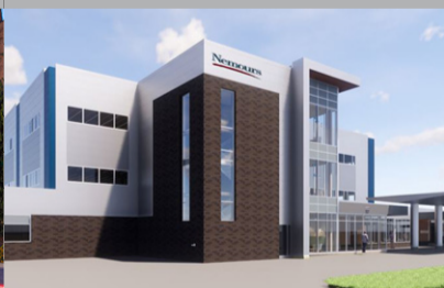
BayHealth Sussex MOB 83,079 s.f. Milford, DE