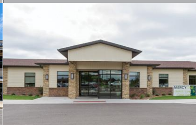
MercyOne Centerville MOB 15,748 s.f. Centerville, IA

Closed - Investment Advisory & Debt Placement