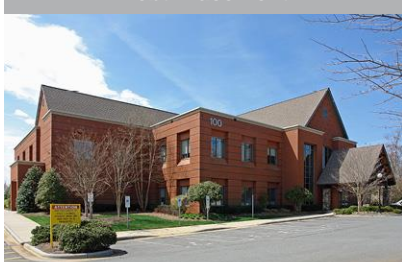
North Carolina MOB Portfolio 532,000 s.f. Winston Salem, NC

Closed - Investment Advisory & Debt Placement