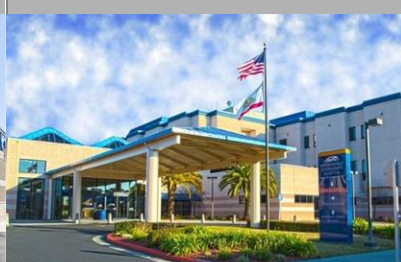
Watsonville Community Hospital 323,650 s.f. Watsonville, CA