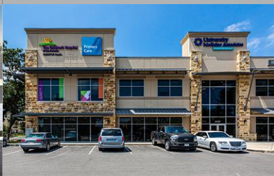
Dominion Crossing 31,613 s.f. San Antonio, TX