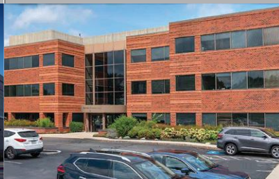
Emerson Hospital Center for Specialty Care 46,350 s.f. Concord, MA