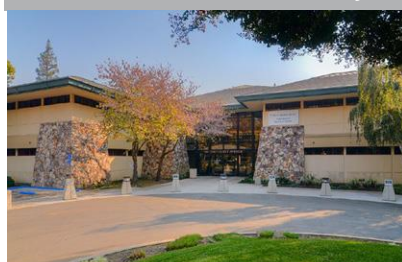
500 University Avenue MOB 47,724 s.f. Sacramento, CA