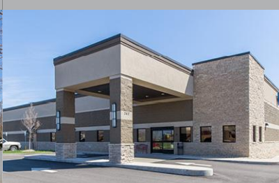
Elliott Bay Dialysis Portfolio 429,840 s.f. National