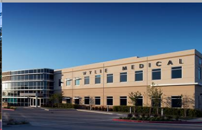
Wylie Medical Plaza 49,151 s.f. Wylie, TX