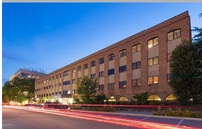
Colesville Medical Campus 212,153 s.f. Silver Springs, MD