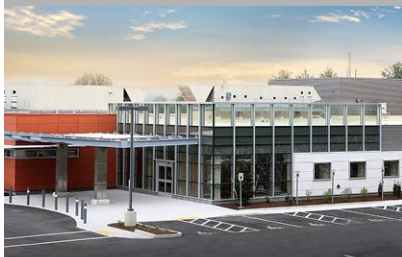
The Surgery Center 41,643 s.f. Shrewsbury, MA