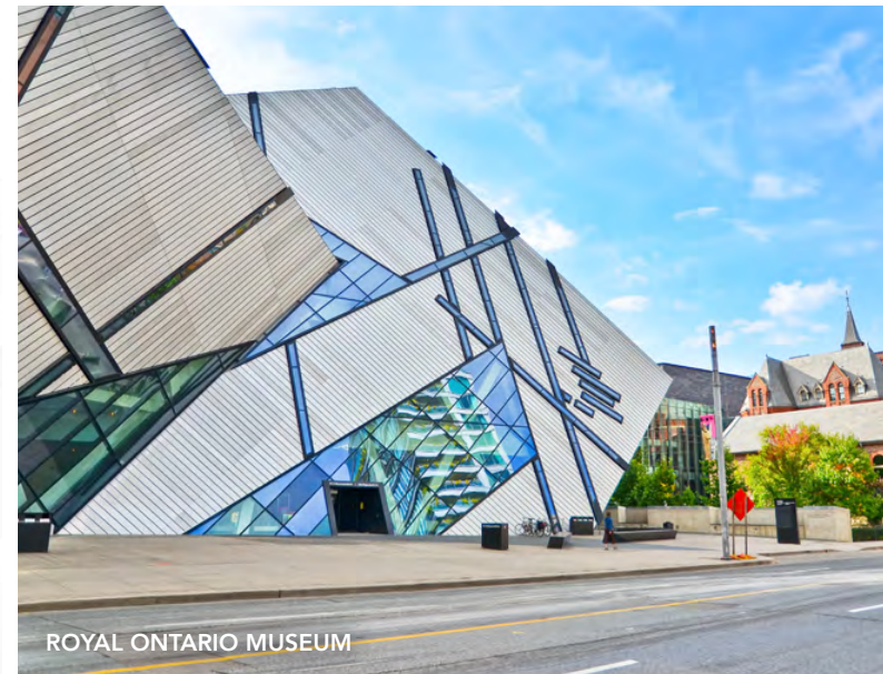
ROYAL ONTARIO MUSEUM