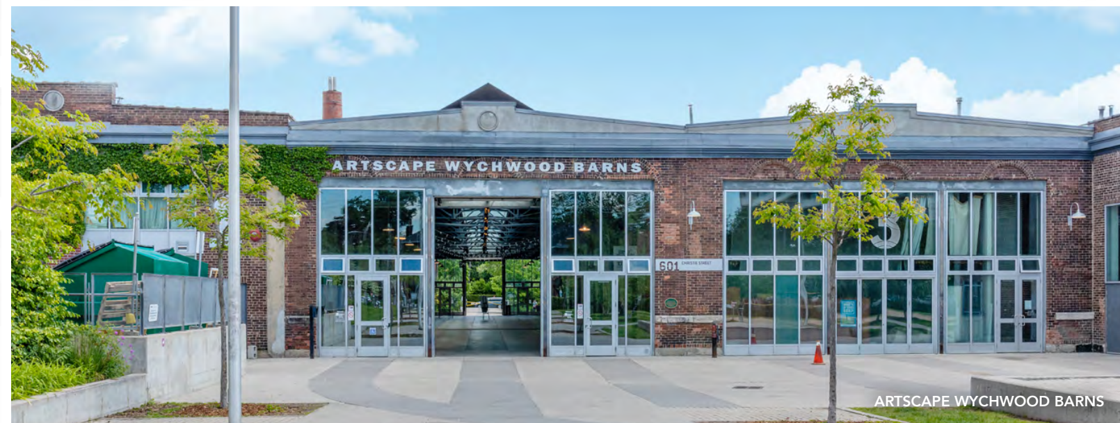
ARTSCAPE WYCHWOOD BARNS